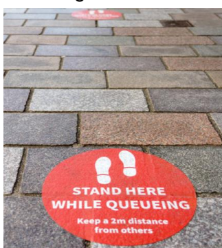
Signage to promote social distancing measures